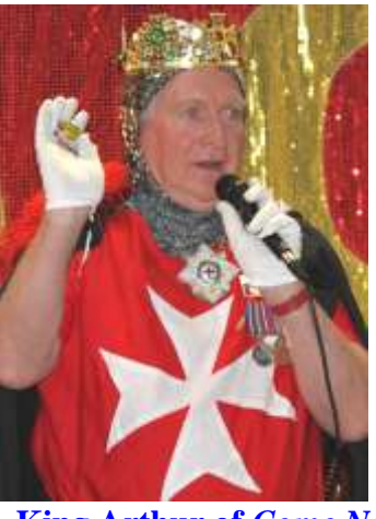
King Arthur of Come Not A Lot tells guests not to eat their Fantales until after their meal