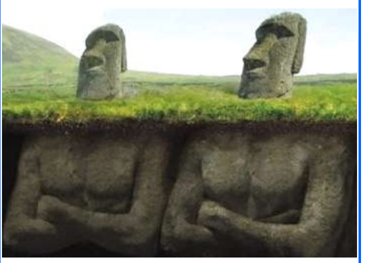
Can this be so??