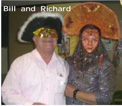
MAG Mature Age Gays Caring for each other, sharing friendships and affection with each other in similar situations to lead as full a life as possible