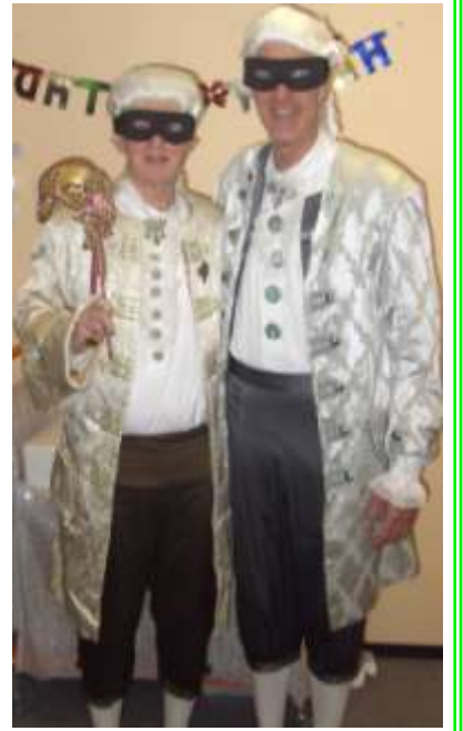
On Page 5 is an Interview with Sir Percy Blakeney [alias the Scarlet Pimpernel]

Finally, store it in the memory, for the future, for you to review, those magical moments produced by, the computer and, you.