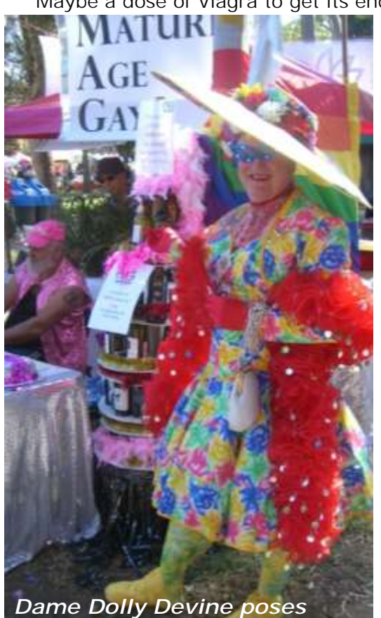
with the Wine Pyramid