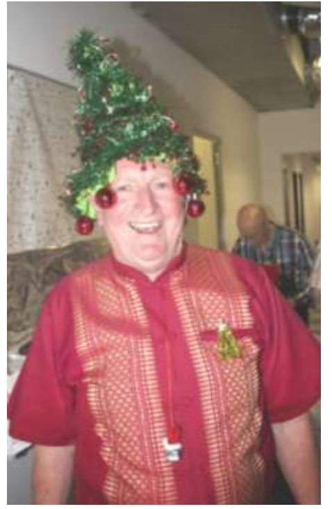
My erect Chrissy Tree — Someone commented that it has been a while since I have had balls on my face, or is that baubles?