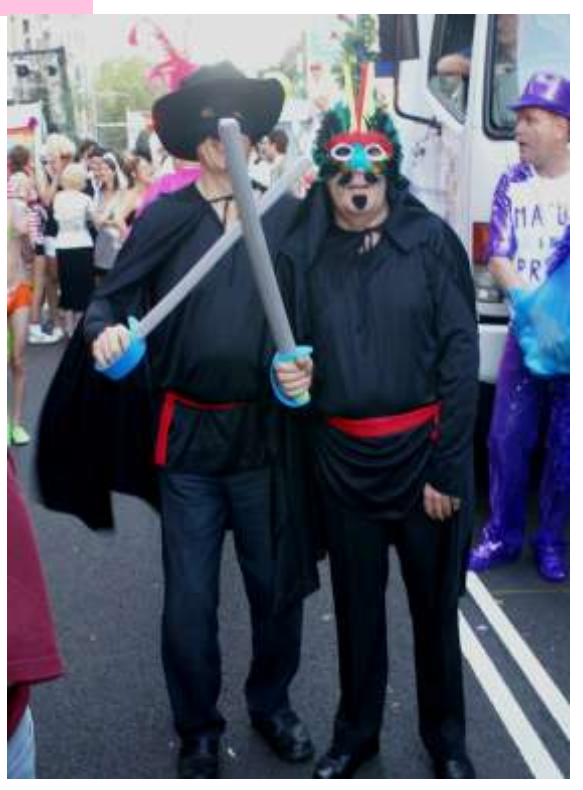
Our two Zorros both had large swords