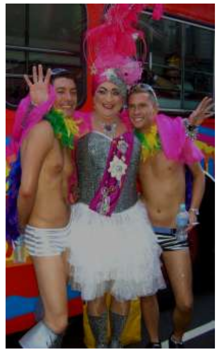
With two cuties before the Parade