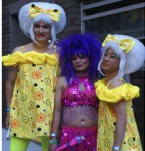
The Yellow Beryls with Chai in purple