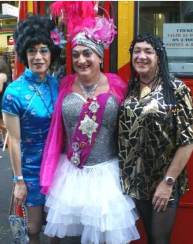
Suzie Wong, Dame Dolly & Cleopatra