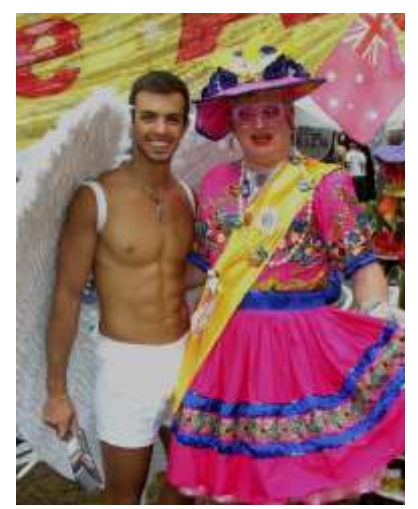
With one of the gorgeous ACON Angels Oh my God!